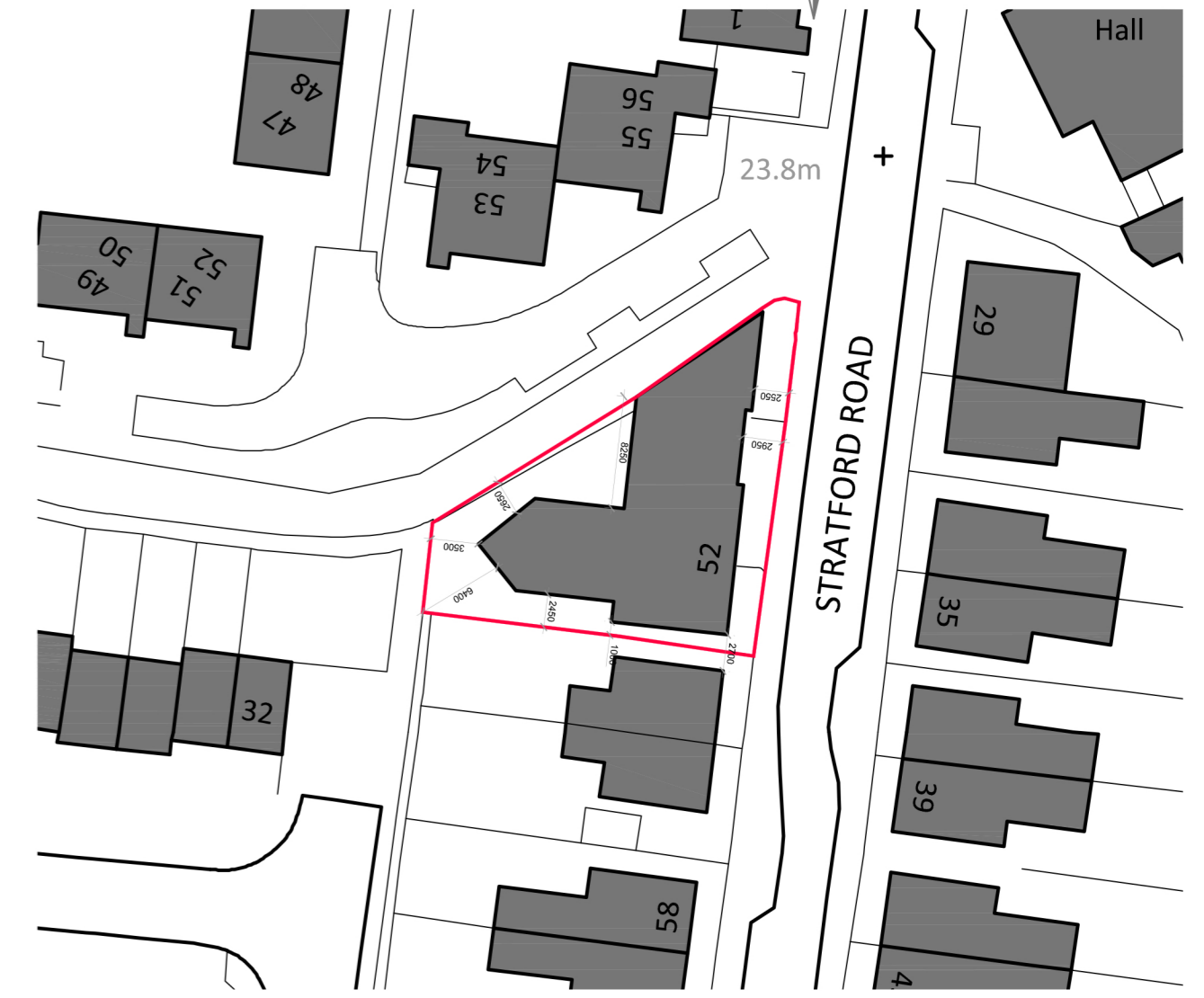
Proposed Site Block Plan 1:500